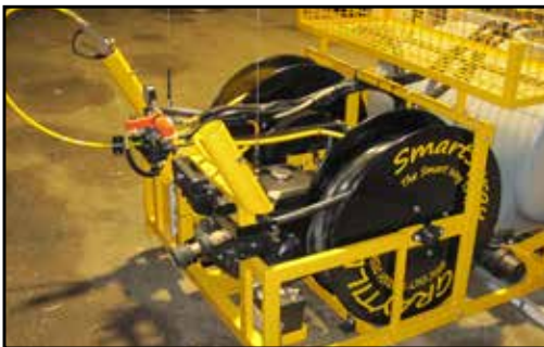
Twin Reel SmartSpray with fire hose.