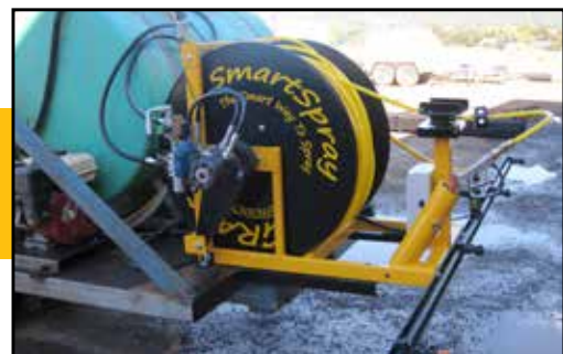
300m Hydraulic Drive SmartSpray Reel with 12m boomless jet boom to suit existing sprayer.