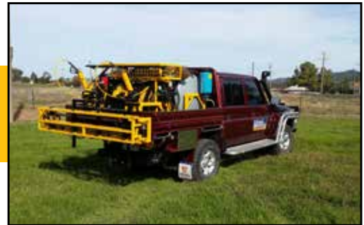
Twin Reel SmartSpray to suit dual cab tray with diesel engine, 10m SmartSpray Boom and triple nozzle boomless jet.