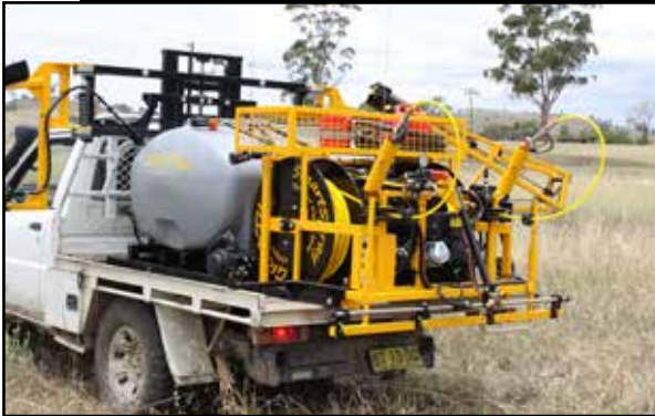
SmartBoom with integrated SmartSpray with boomless jet.