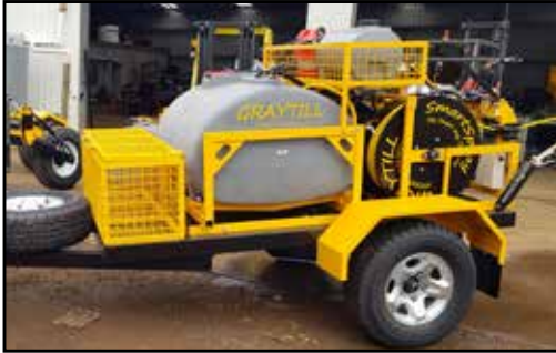
Single axle trailed SmartSpray.