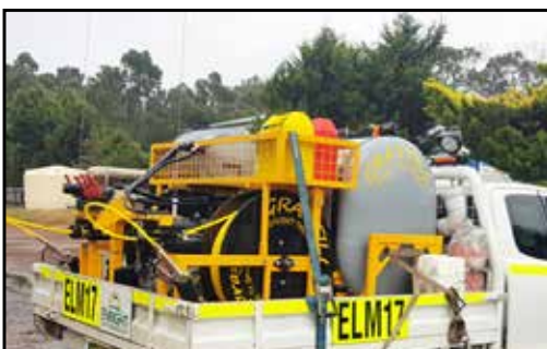
Twin reel SmartSpray, mine spec with battery isolator, E stop, diesel engine and 35L hand wash and flush tank.